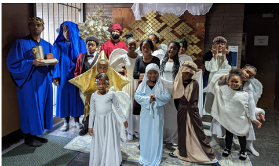
The Union Foundation supports a thriving youth ministry at Union Baptist Church as one of its many service-centered programs.