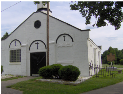
The rectory at Union Baptist Cemetery, one of two cemeteries under the stewardship of the Union Foundation.

We are The Union Foundation—a partnering entity of Union Baptist Church, the oldest, continually run black Baptist congregation in the state of Ohio. From its founding in 1831 to today, Union Baptist Church has been a vital center of the Black community, providing critical social, political, and educational opportunities to its congregants and Greater Cincinnati. The Foundation's primary purpose is to impact our surrounding community in a positive manner by providing services aimed at improving the lives of community members and enriching their cultural assets.