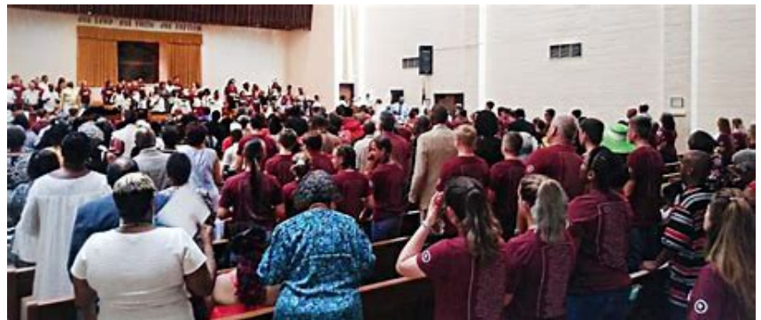
Community engagement and interaction lies at the heart of our mission.