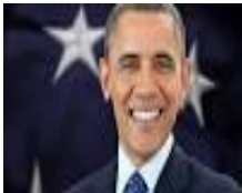
Barack Obama 44th U.S. President