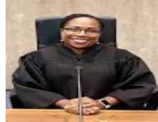
Ketanji Brown Jackson U.S. Supreme Court Justice