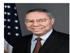
Colin Powell Former U.S. Secretary of State